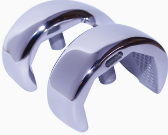
Femoral Component Femur Parçası