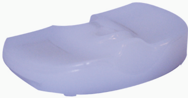
Tibial Insert Component Tibial Insert