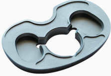
Tibial Block Tibia Yükseltici Blok