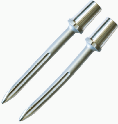
Cemented Large Conical Stem Çimentolu Büyük Konik Stem