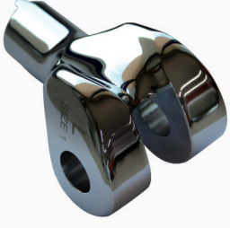
Distal Femur Full Resection Component Femur Alt Uç Full Rezeksiyon Parçası