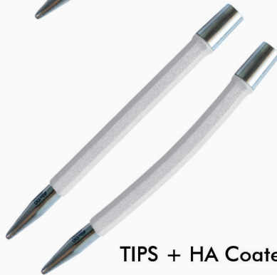
TIPS + HA Coated