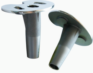
Modular Proximal Tibia Minimal Resection Component Uzatmalı Tibia Üst Uç Kısmı Rezeksiyon Parçası