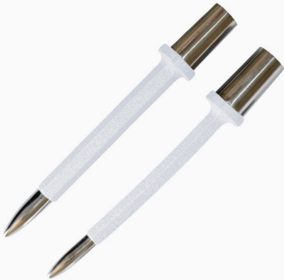
Uncemented Hexagonal Large Conical Stem Çimentosuz Altıgen Büyük Konik Stem