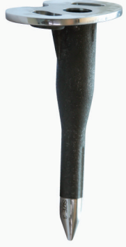
Proximal Tibia Minimal Resection Component Tibia Üst Uç Kısmi Rezeksiyon Parçası