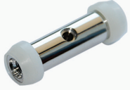
Boss Core Bar Göbek Mili