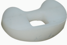
Insert Tibia Yatağı