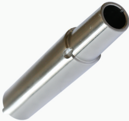
Extension Piece Uzatma Borusu