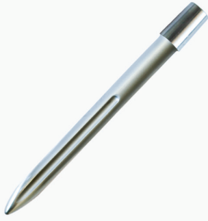
Cemented Hexagonal Small Conical Stem Çimentolu Altıgen Küçük Konik Stem