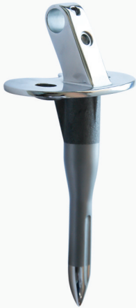
Fix Proximal Tibia Minimal Resection Component Sabit Mafsallı Tibia Üst Uç Kısmi Rezeksiyon Parçası