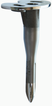
Proximal Tibia Minimal Resection Component Tibia Üst Uç Kısmi Rezeksiyon Parçası