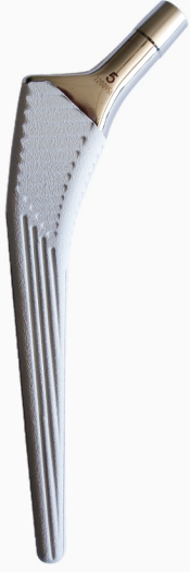
Uncemented Ha Coated Çimentosuz Ha Kaplamalı